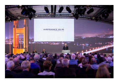
Report on the Group's latest Annual General Shareholders' Meeting.