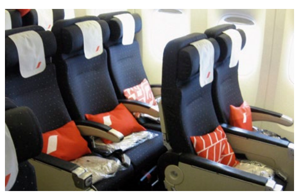
*Purchasers must commit to never installing these seats in aircraft and to no resale for a five-year period.

If you are interested you can place your order, specifying the desired models and quantities, by email to <a href="mailto:beblox@airfrance.fr">beblox@airfrance.fr</a>